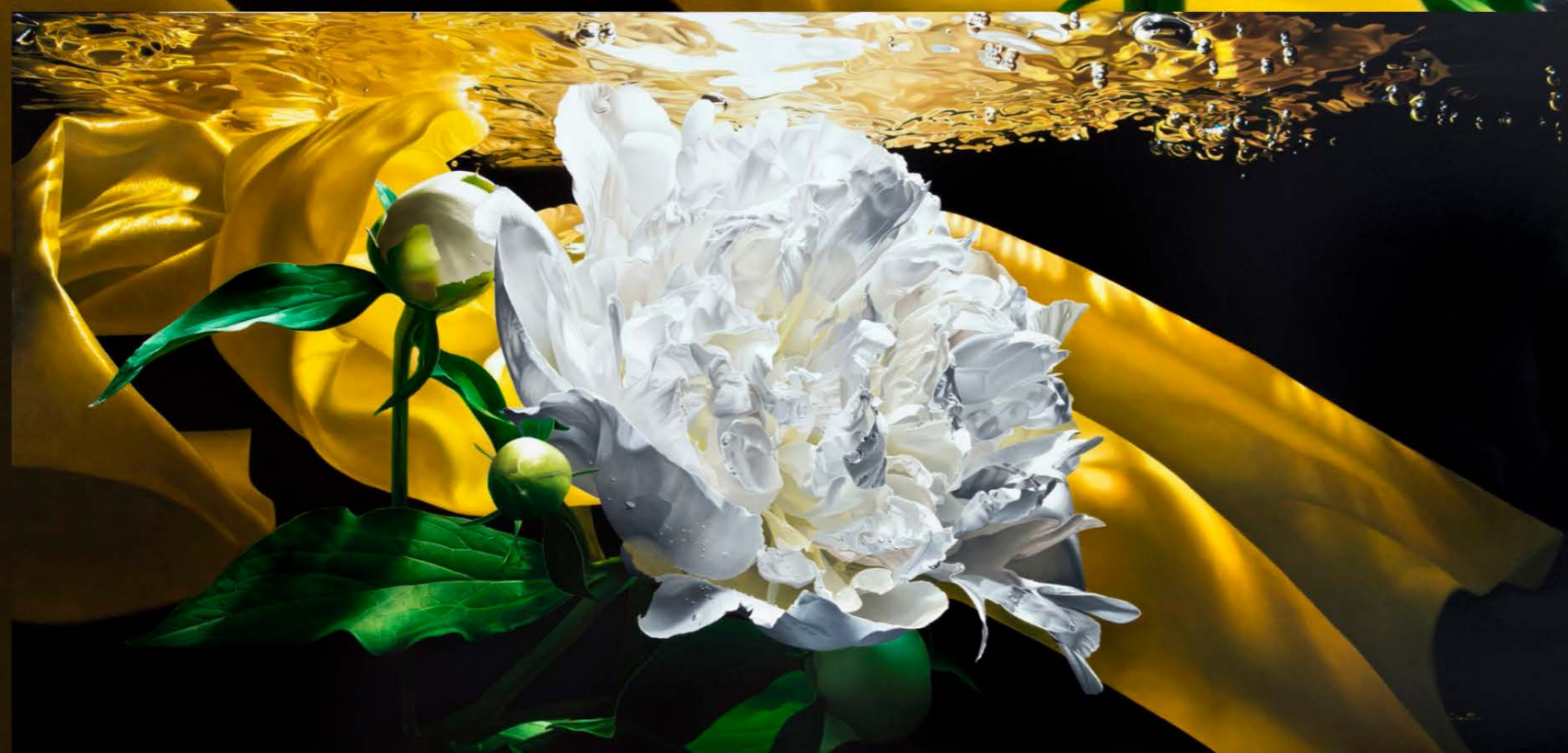
2014 "2000 LEAGUES UNDER THE SEA" 40" x 84" / 101 x 214 cm. Oil on Canvas