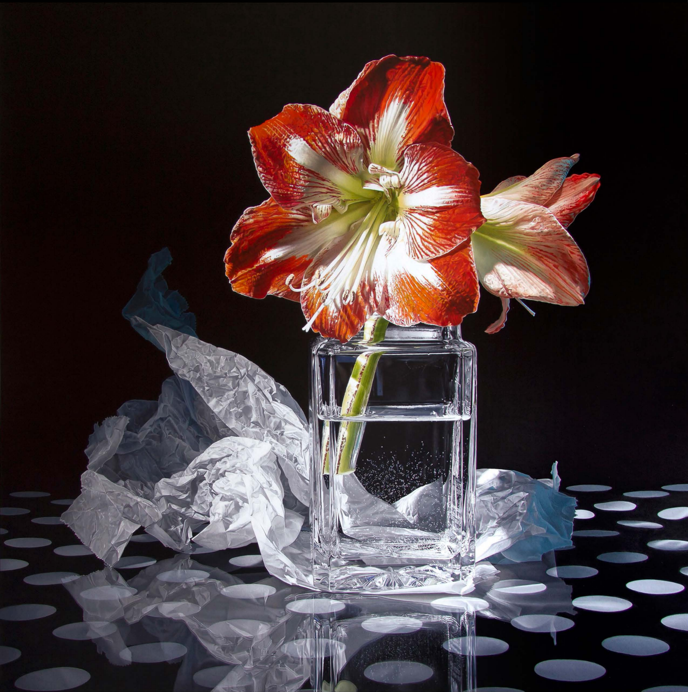
2013 "MINERVA" 60" x 60" / 152 cm x 152 cm. Oil on canvas.