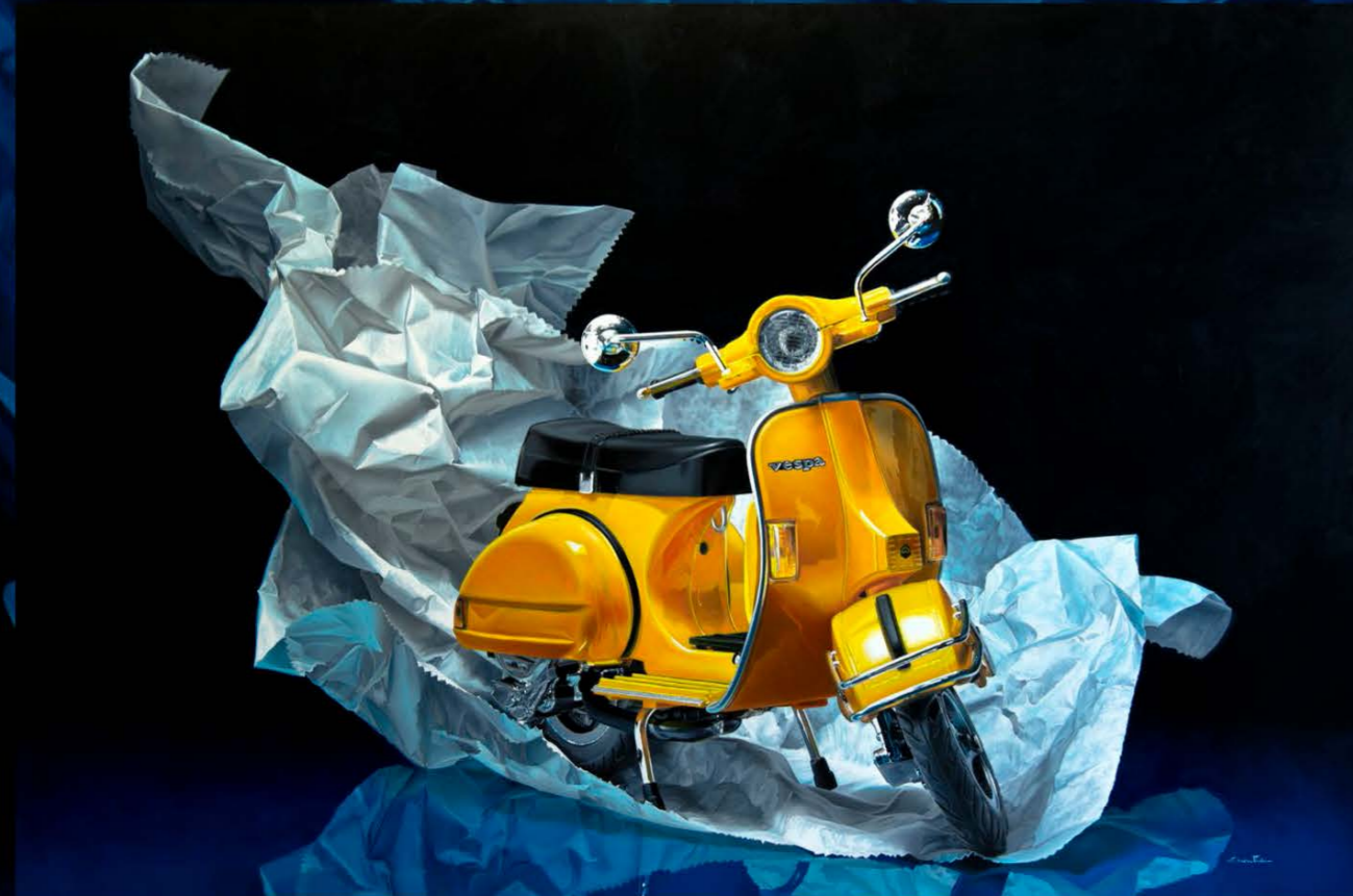
2019 "AND AWAY WE GO" 36" x 54" / 91 x 137 cm. Oil on canvas.