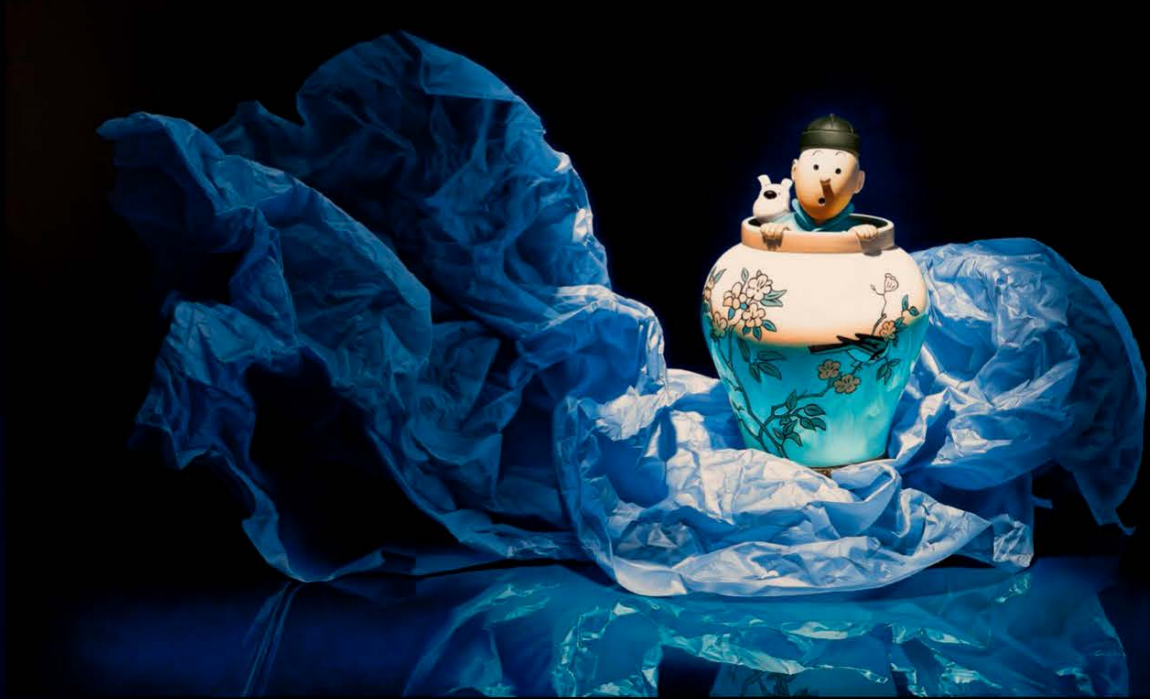
2012 "TOTO I DON'T THINK WE ARE IN KANSAS ANYMORE" 48" x 84" / 122 x 214 cm. Oil on canvas.