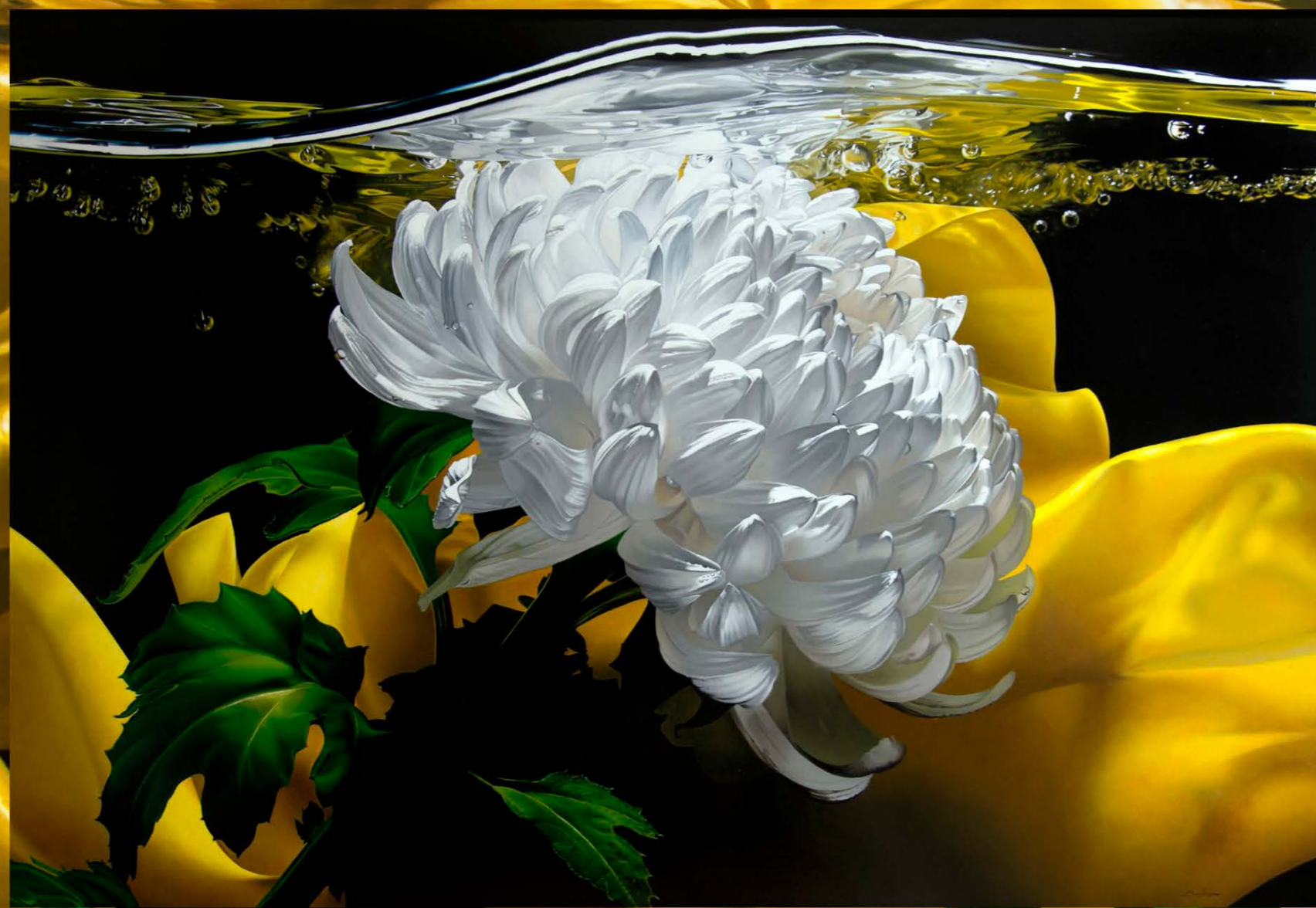
2019 "A BREATH OF FRESH AIR" 48" x 72" / 122 x 183 cm. Oil on canvas.