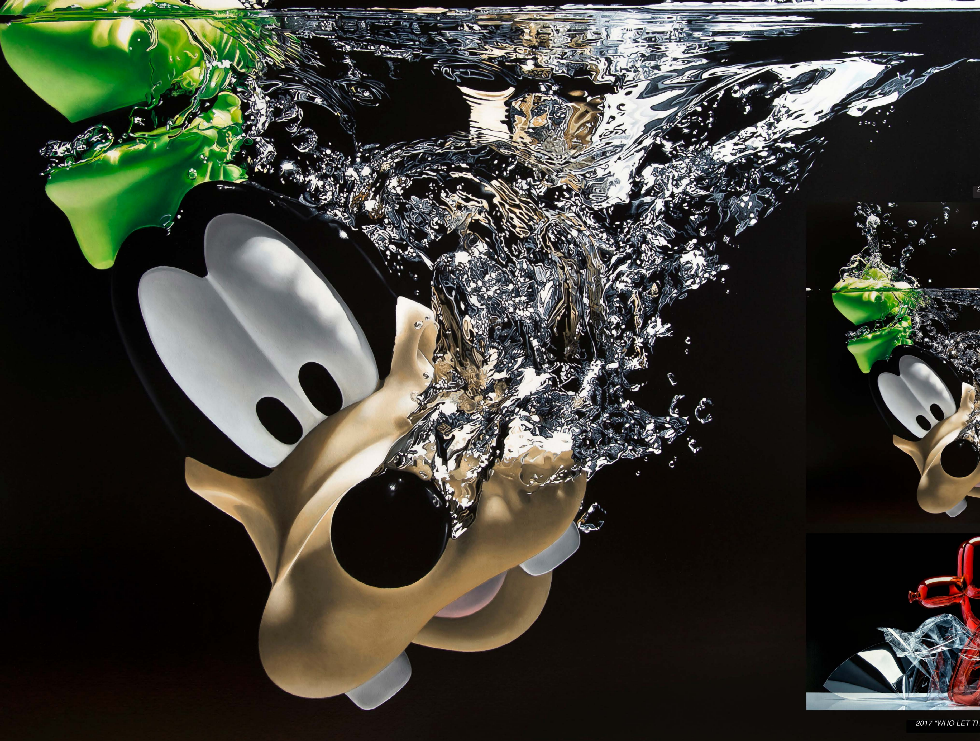
2018 "GO 4 IT" 48" x 53" / 122 x 135 cm. Oil on canvas.