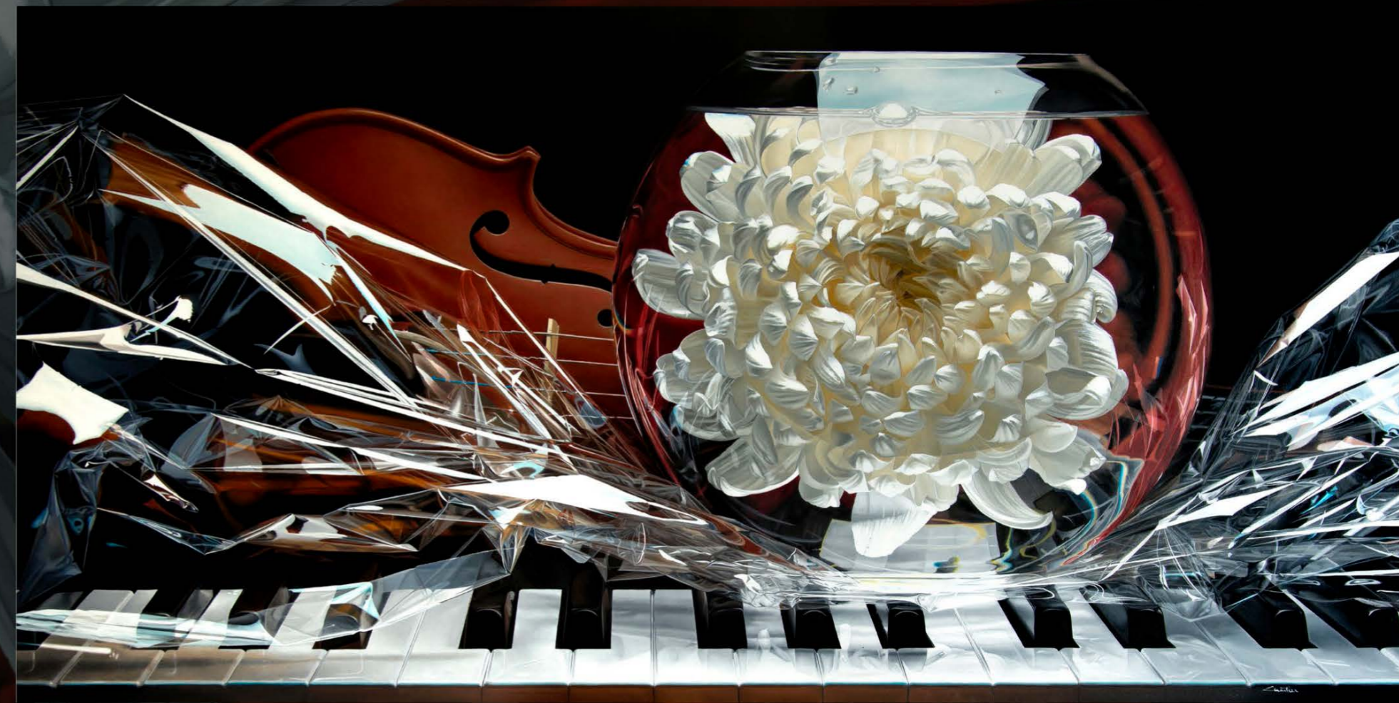
2018 "CLAUDYNE Synphonie en C major" 36" x 72" / 91 x 182 cm. Oil on canvas.