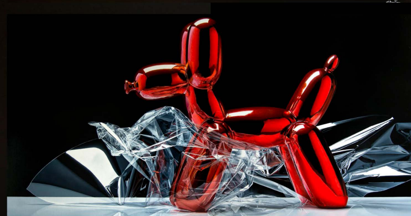
2017 "WHO LET THE DOG OUT?" 40" x 80" / 102 x 204 cm. Oil on canvas.