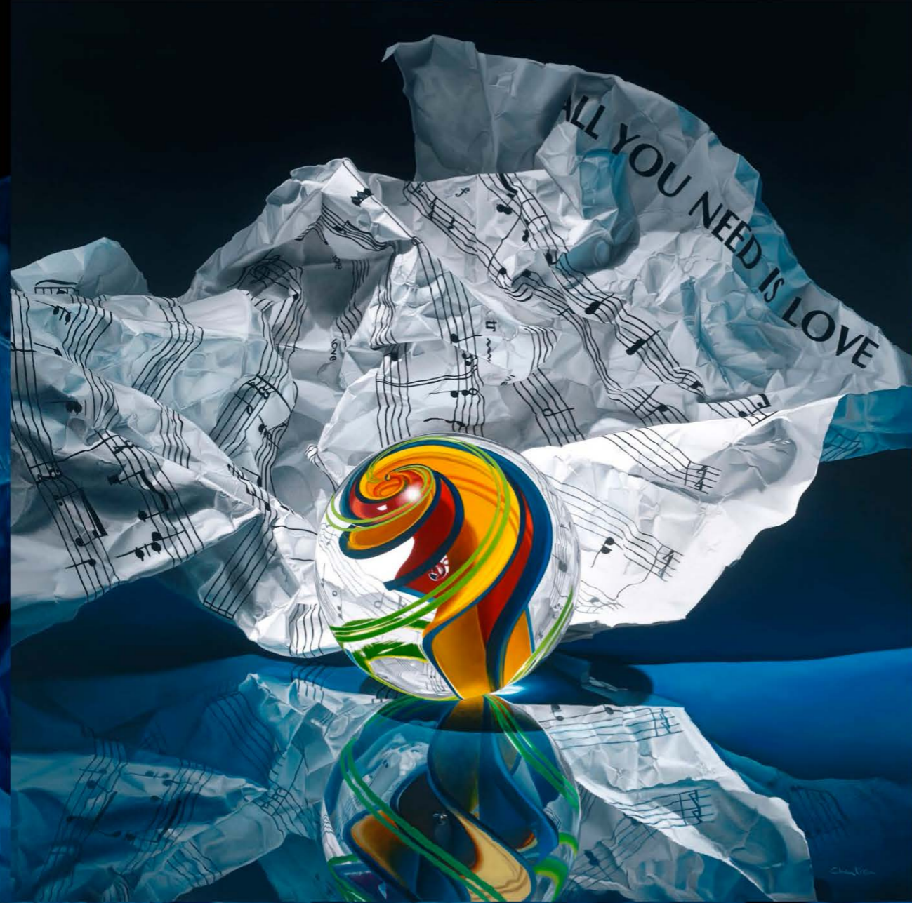
2011 "ALL YOU NEED IS LOVE" 40" x 40" / 101 x 101 cm.