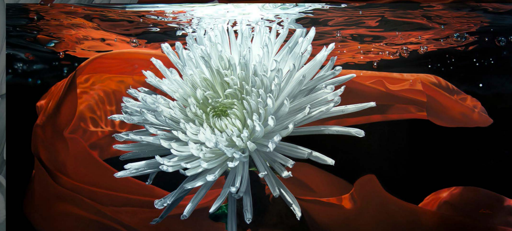
2016 "SUMMER PASSION" 36" x 80" / 91 x 204 cm. Oil on canvas.