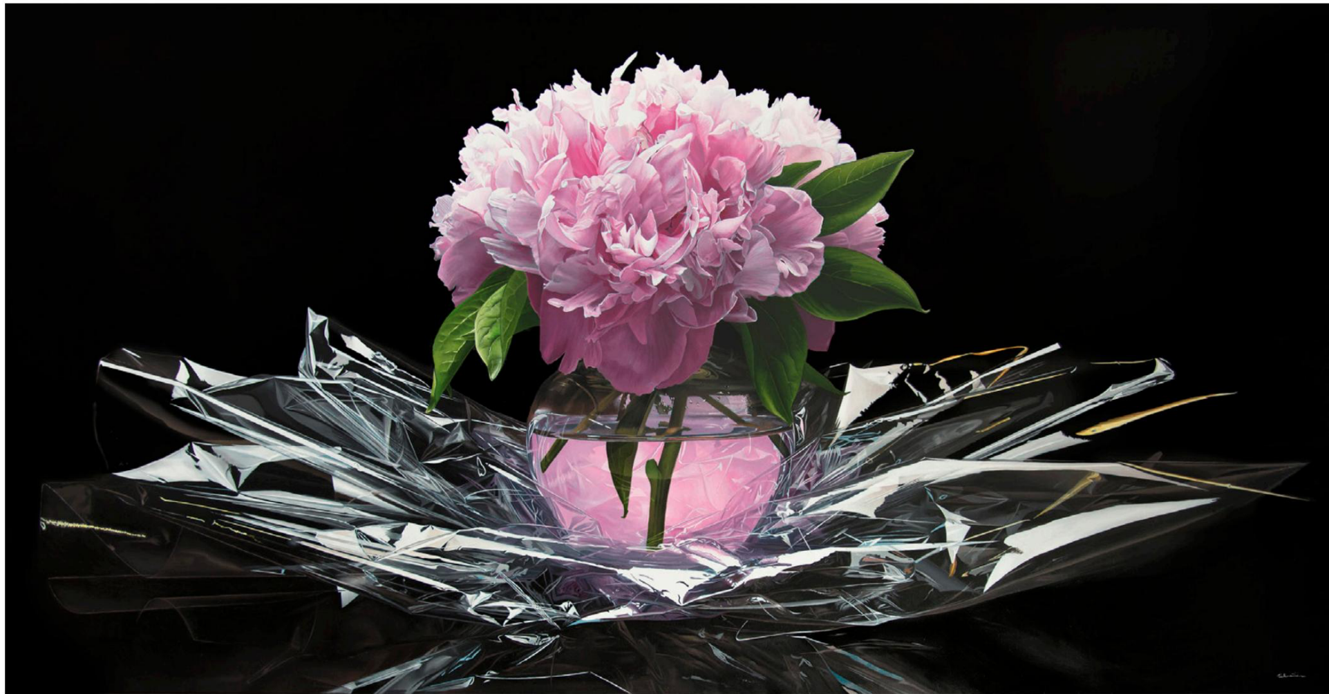
Pleasure & Pain Oil on canvas 40 x 80 in.

Chartier's paintings reveal a mastery of detailed realism that extends beyond hyperrealism, transforming simple objects and natural elements into visions of elegance, beauty, and grace. His luminous canvases are celebrated for their joyful atmospheres and orchestration of color and light, capturing moments that radiate both serenity and wonder.