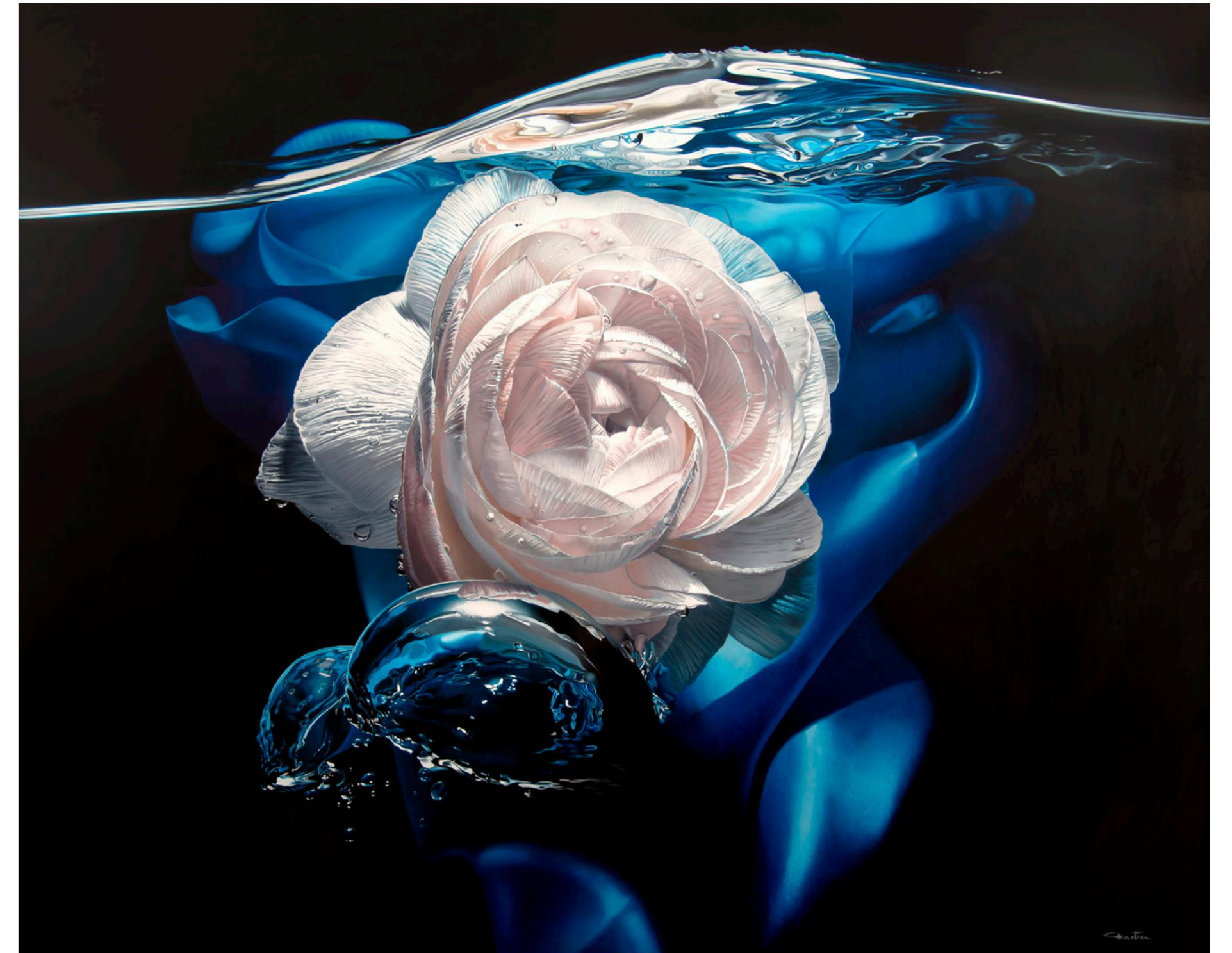
The Sky Is the Limit Oil on canvas 48 x 60 in.